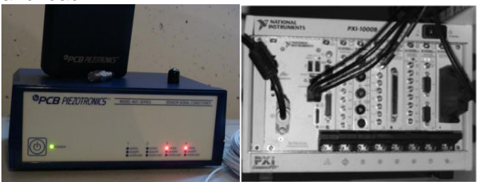
Figure 1: Left: High-speed pressure transducer (on top) and signal conditioning unit. Right: Fast waveform digitizer in PXI system.

measurement method presented could be used, together with mass sorting and measurement of velocity standard deviations to determine which hypothesis is better supported in a given cartridge and load.